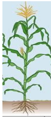
Event A x Event B x Event C