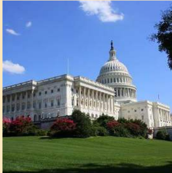
Capitol Hill, Washington, DC