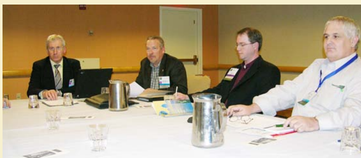
International Outreach Committee