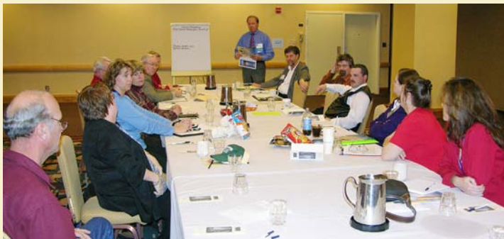
Research Education Committee