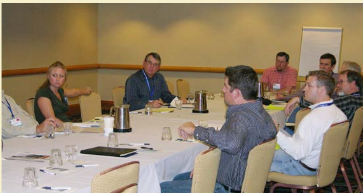
Consultant Education Committee