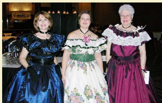
Three Lovely Ladies