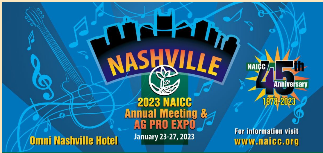
EXHIBIT HALL EXTRAVAGANZA