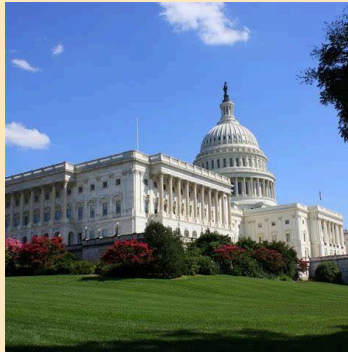
Capitol Hill, Washington, DC