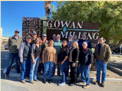
Gowan Milling, Yuma AZ