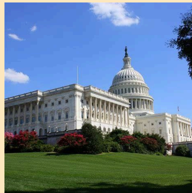
Capitol Hill, Washington, D.C.