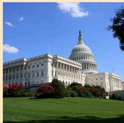
Capitol Hill, Washington, D.C.