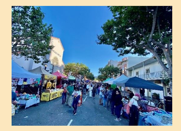
Farmers Market near the Portola