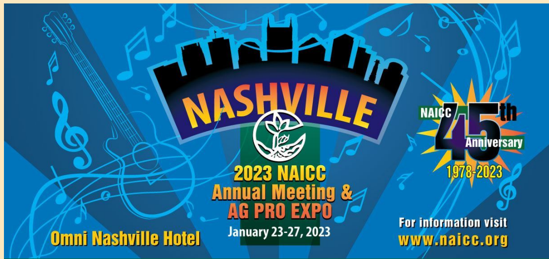
Exhibit Hall Extravaganza

Looking for a way to increase you Company's brand awareness? We have several sponsorship opportunities to fit any size budget. CLICK HERE to see a complete list or email allisonjones@naicc.org for more information.