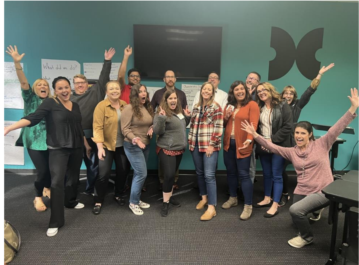
St. Louis Training Center 3-day Leadership Intensive