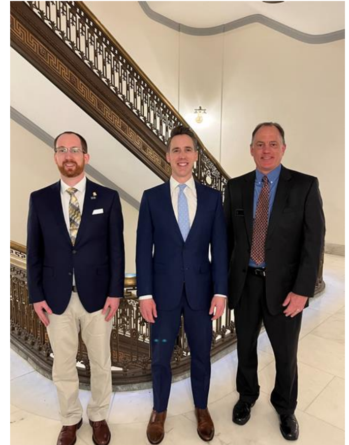
Meet and greet with Sen. Josh Hawley